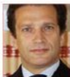
Manuel de Andrade Neves Abreu Advogados

Address: Alcalá 61, 28014 Madrid Tel: + 34 91 436 04 32 Fax: + 34 91 436 04 30 Email: jmrodriguez@perezllorca.com Web: www.perezllorca.com Main practice areas: Administrative & Public Law, Regulatory and Renewables