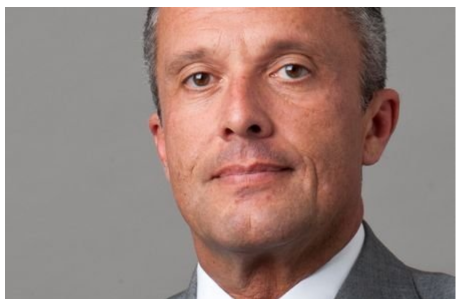
A Lisbon-based Cuatrecasas team advised Indico Capital Partners on a €1.1 million investment in Portuguese start-up EatTasty.