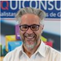
Sérgio Espírito Santo