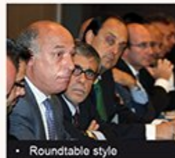
• Roundtable style