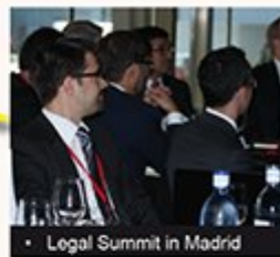
• Legal Summit in Madrid

We have invited a unique group of General Counsel and law firm leaders. The discussion will be informal and highly interactive. At the start, we will hear the opinions of leading international experts. Working in small teams, we will then debate the issues at our tables before collecting our conclusions. Iberian Lawyer will be collecting the conclusions for an upcoming special report.